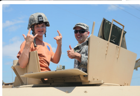
SMILE on Down Syndrome Trucks and Heroes