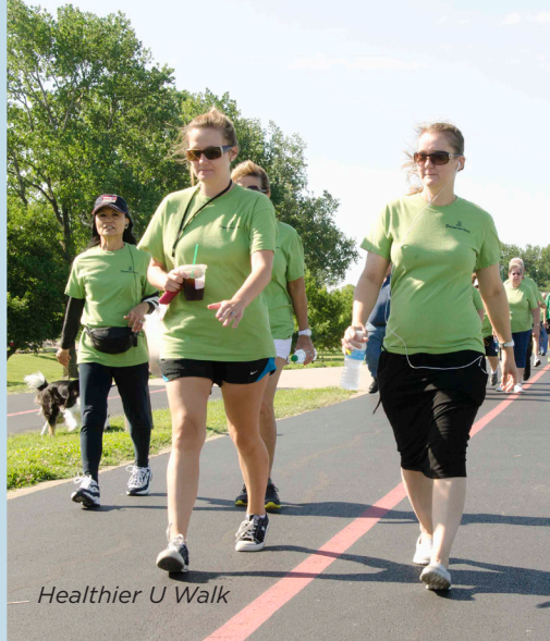
Healthier U Walk