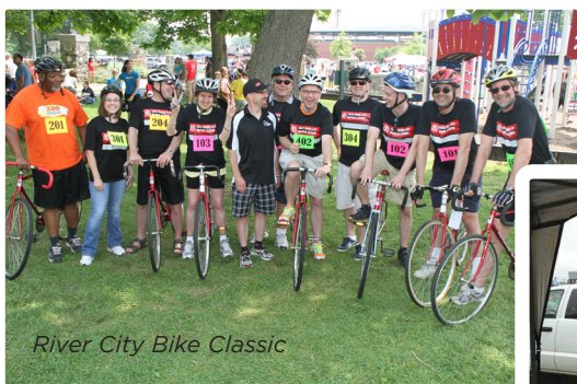
River City Bike Classic