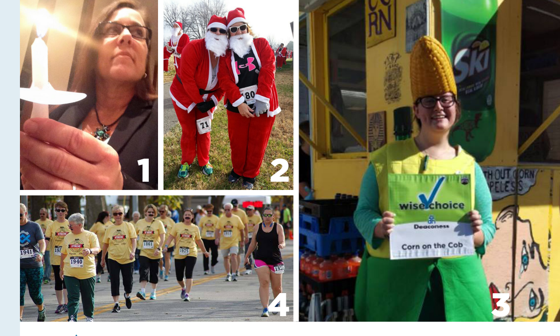
▲ 1. Lung Cancer Vigil; 2. The annual Rotary Santa Run; 3. Wise Choice at the Fall Festival; 4. 2015 Stache Dash

The grant application was successful and throughout 2015, more than 20 trainers were certified and plans made to offer the course to schools, churches, businesses, and organizations throughout the Tri-State.